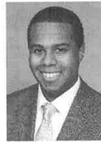
Rep. Chaz Beasley