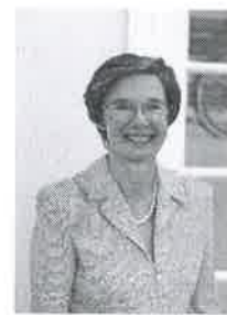
Rep. Rachel Hunt