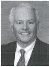
Rep. Hugh Blackwell