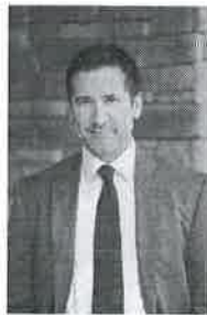
Rep. Terrence Everitt