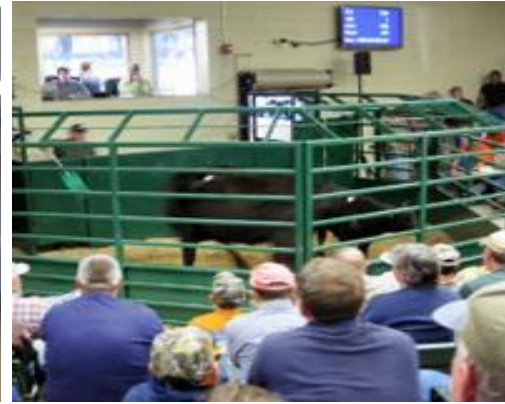
WNC Regional Livestock Facility