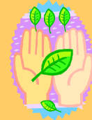
Non-profit conservation groups