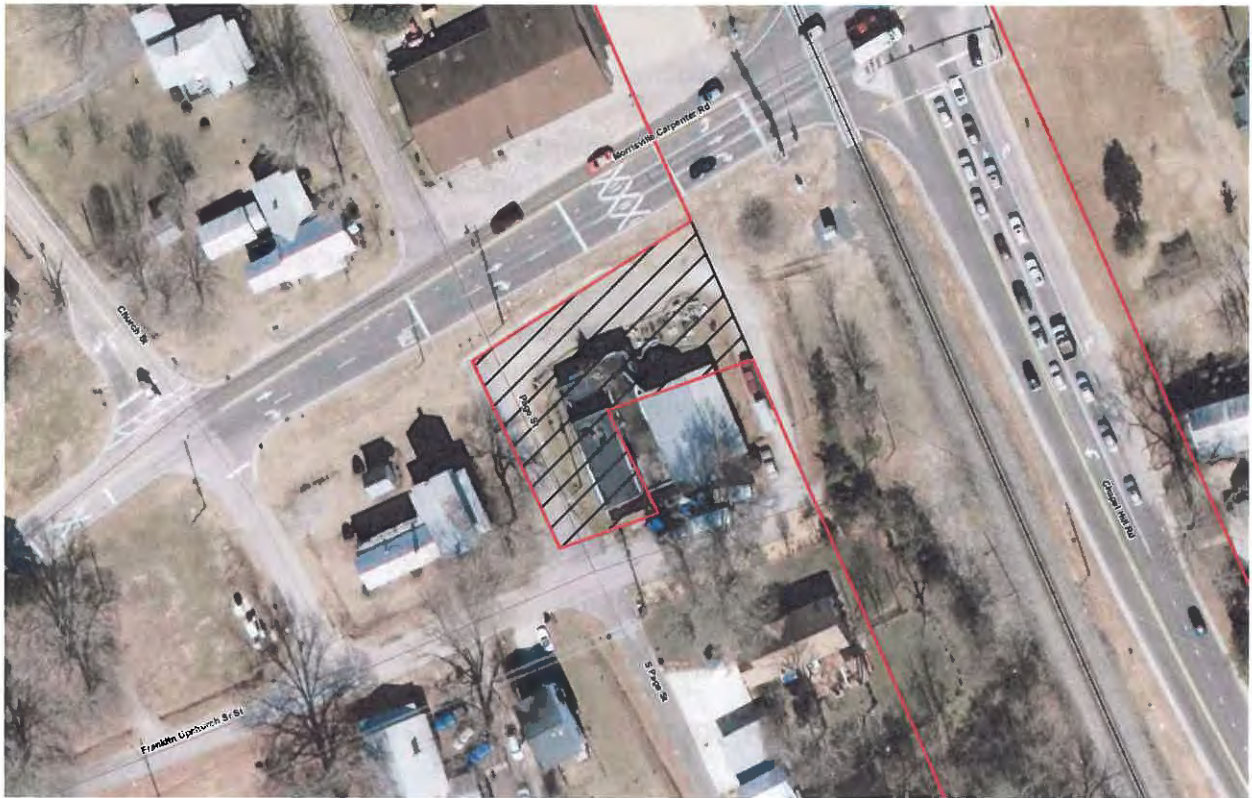
North Carolina Railroad Company Morrisville Lot Town of Morrisville, Wake County

Encroachments: Adjacent building encroachment