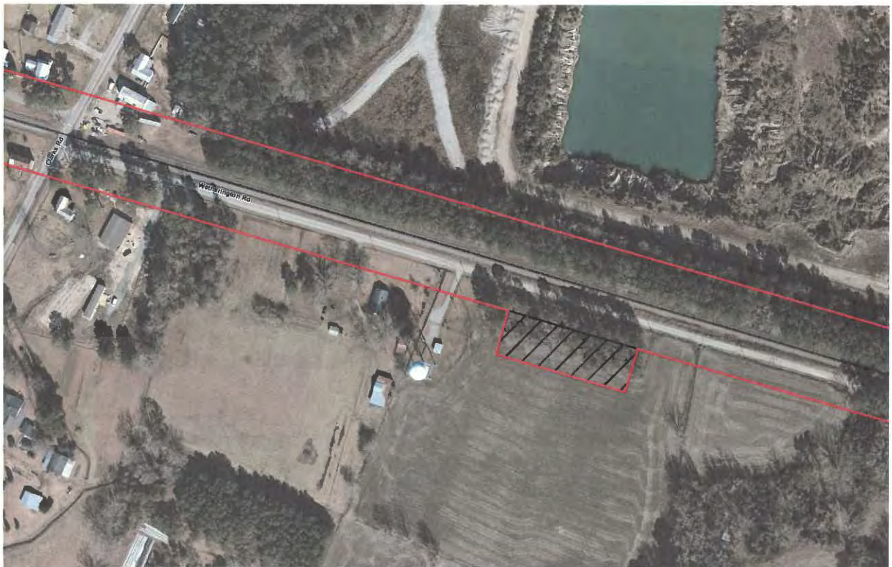
North Carolina Railroad Company Clarks Lot Craven County

Other Issues: Lot is not on a public roadway—land-locked. Adjacent landowner's deed description overlaps with a portion of this parcel.