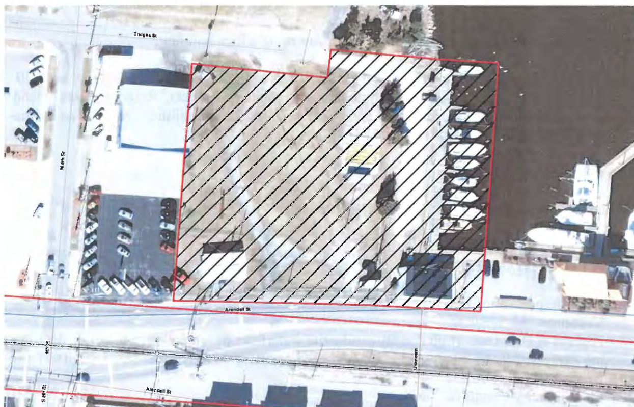
North Carolina Railroad Company Bridges Street Lot Town of Morehead City, Carteret County