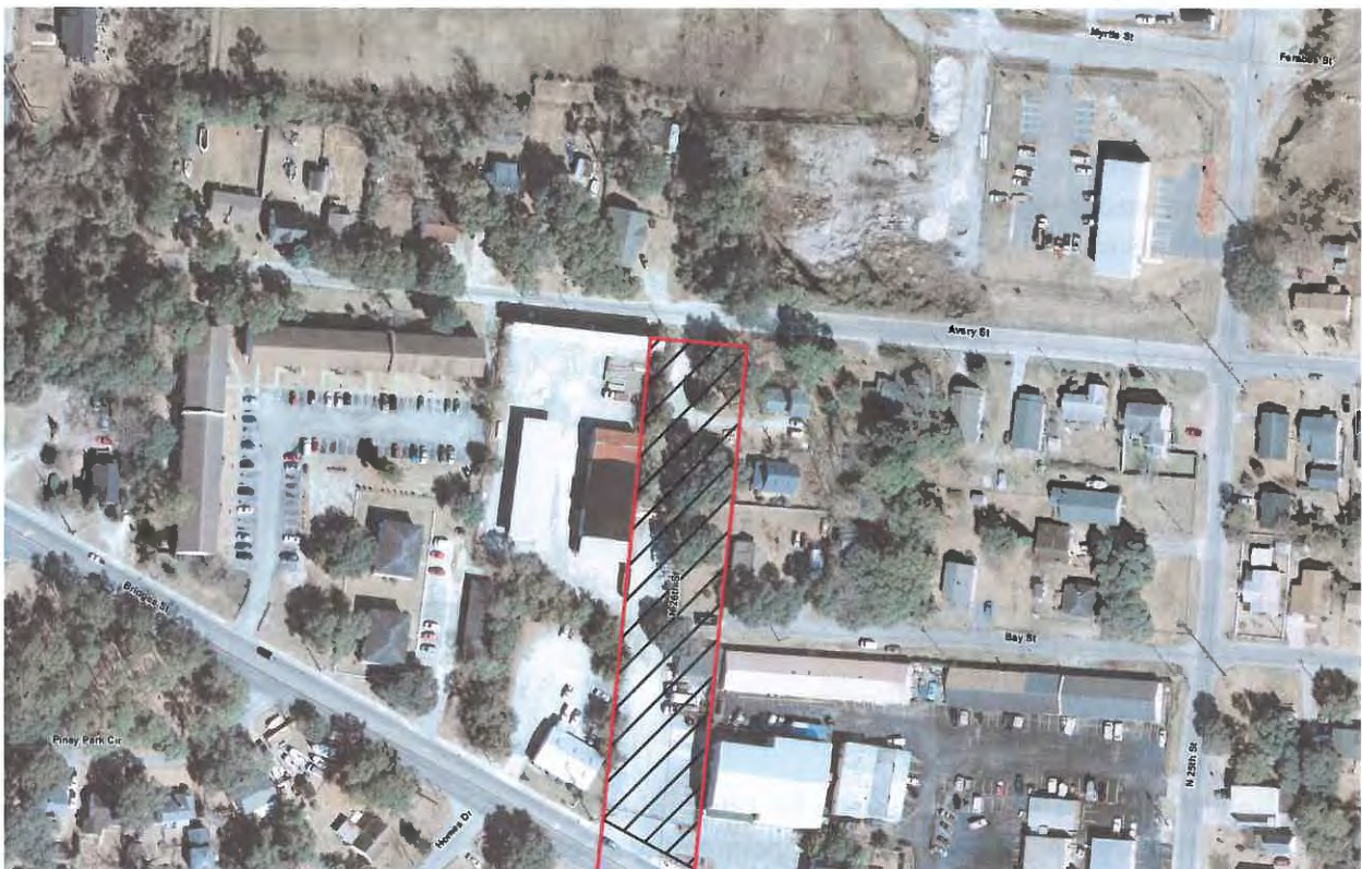
North Carolina Railroad Company Wye Parcel Extension Town of Morehead City, Carteret County

Encroachments: Licensee claims ownership and three adjoining landowners have deeds that overlap with NCRR property line.