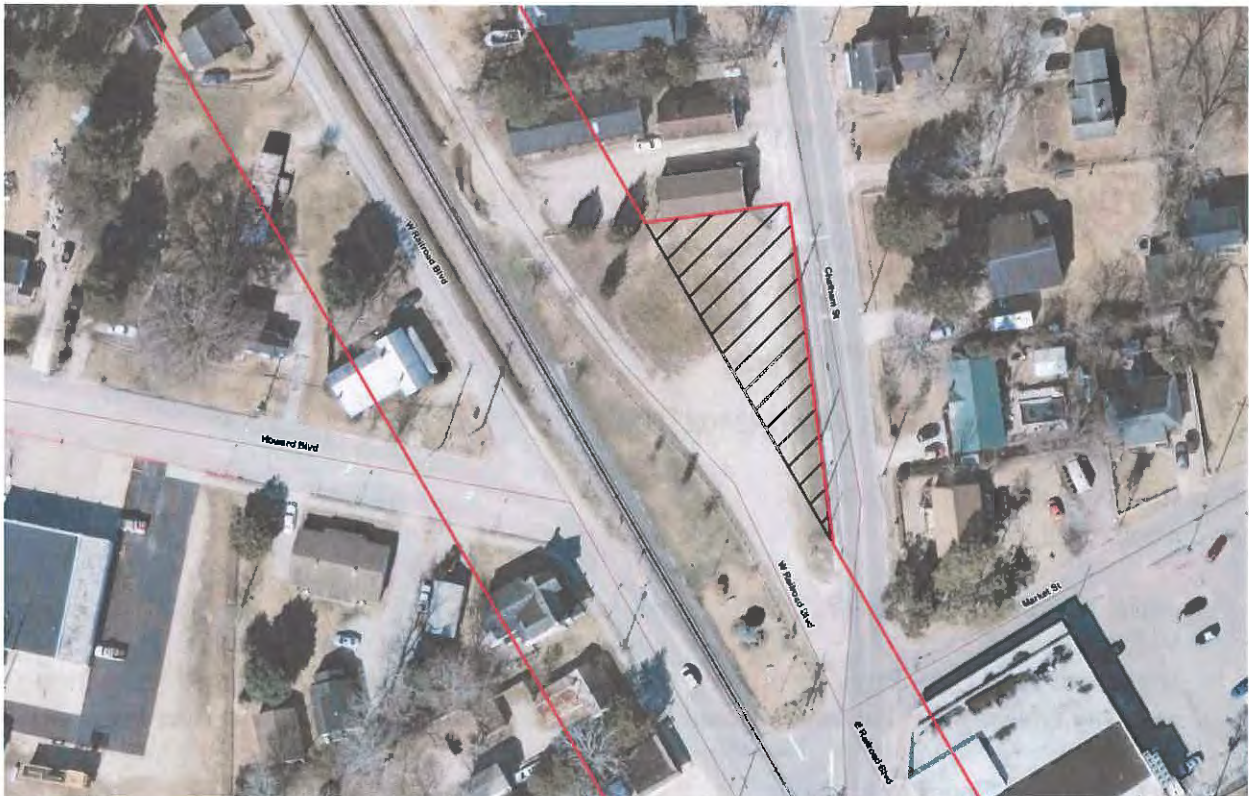
North Carolina Railroad Company Newport Lot Town of Newport, Carteret County