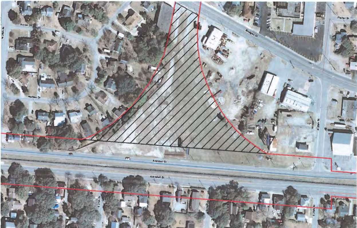
North Carolina Railroad Company Wye Parcel Town of Morehead City, Carteret County