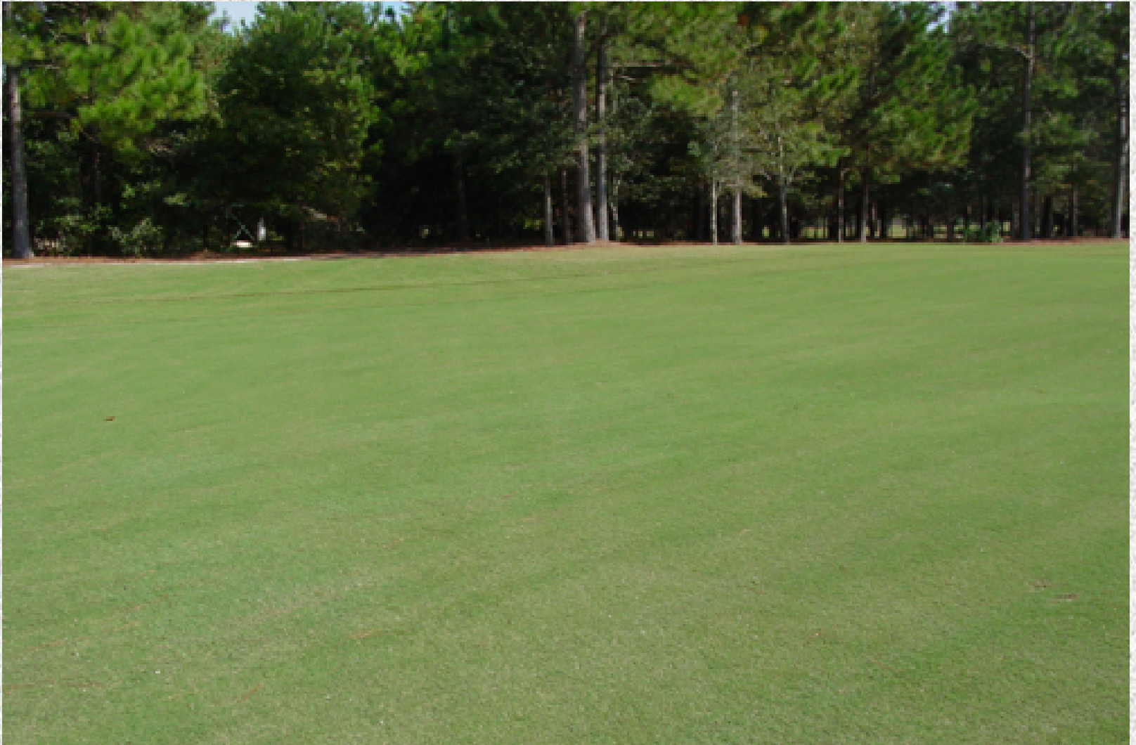
Eagle Point - Hole 8 - After