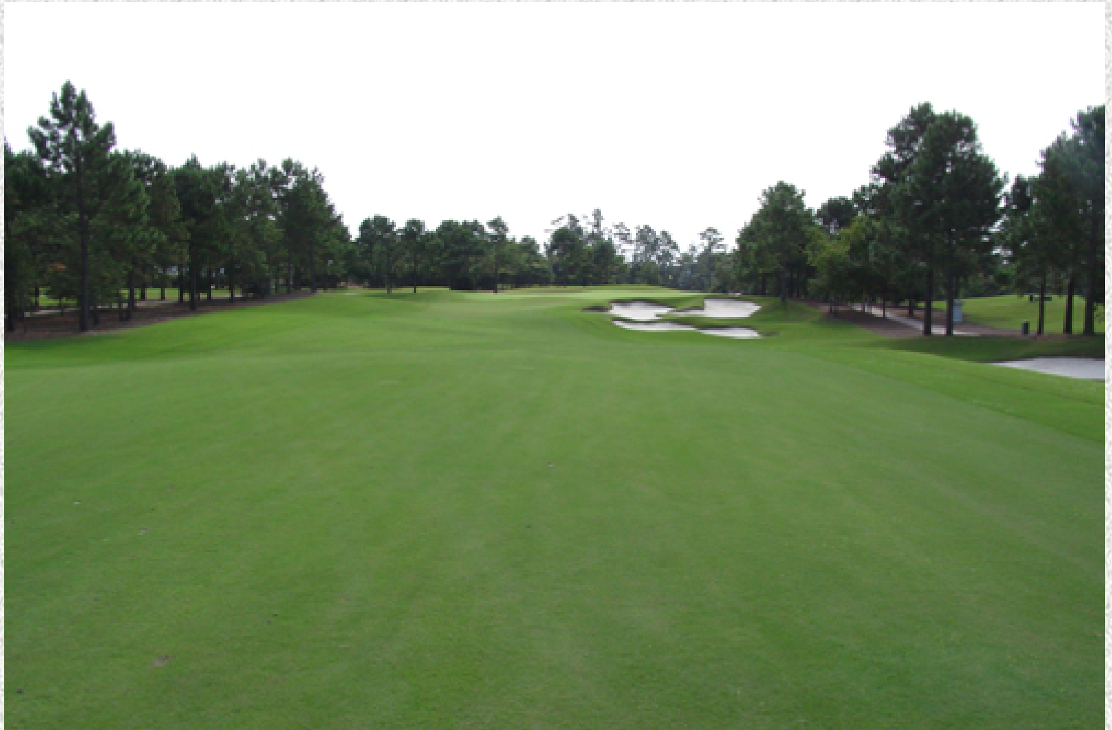
Eagle Point - Hole 8 - After