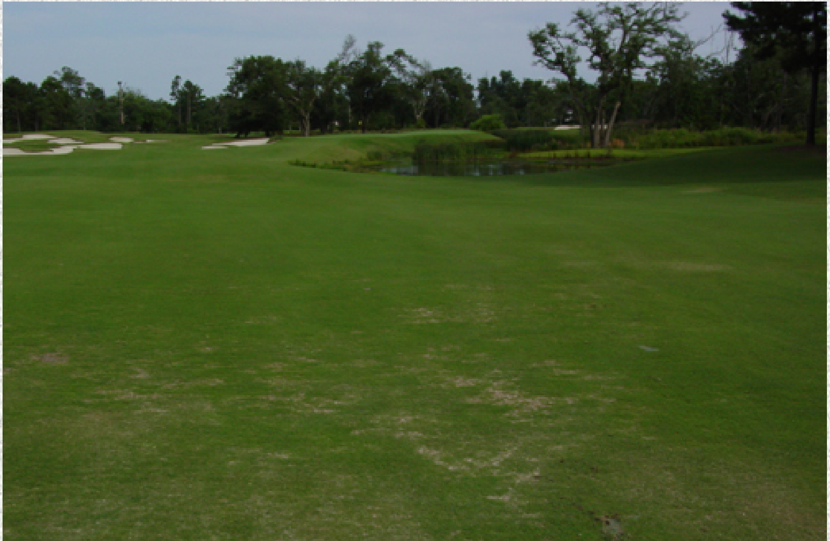
Eagle Point – Hole 18 - Before