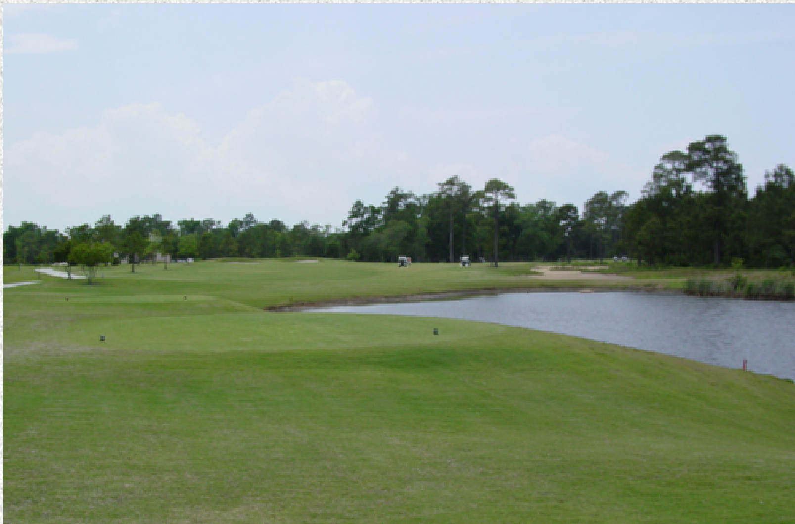
Landfall - Hole 2 - Before