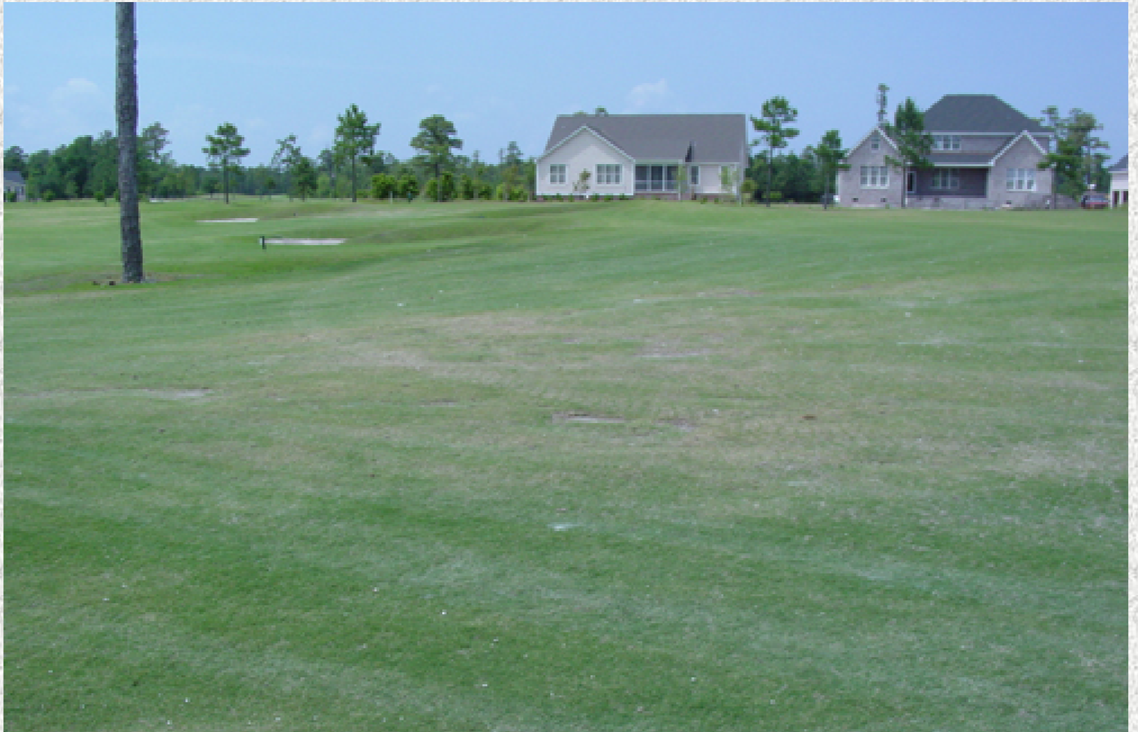
Landfall - Hole 8 - Before