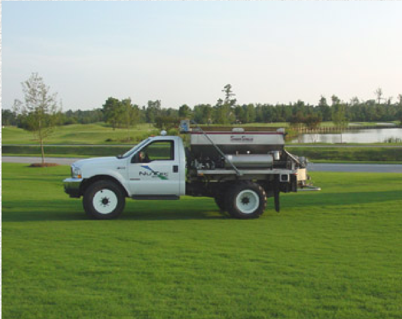
Precision Application of Fertilizer