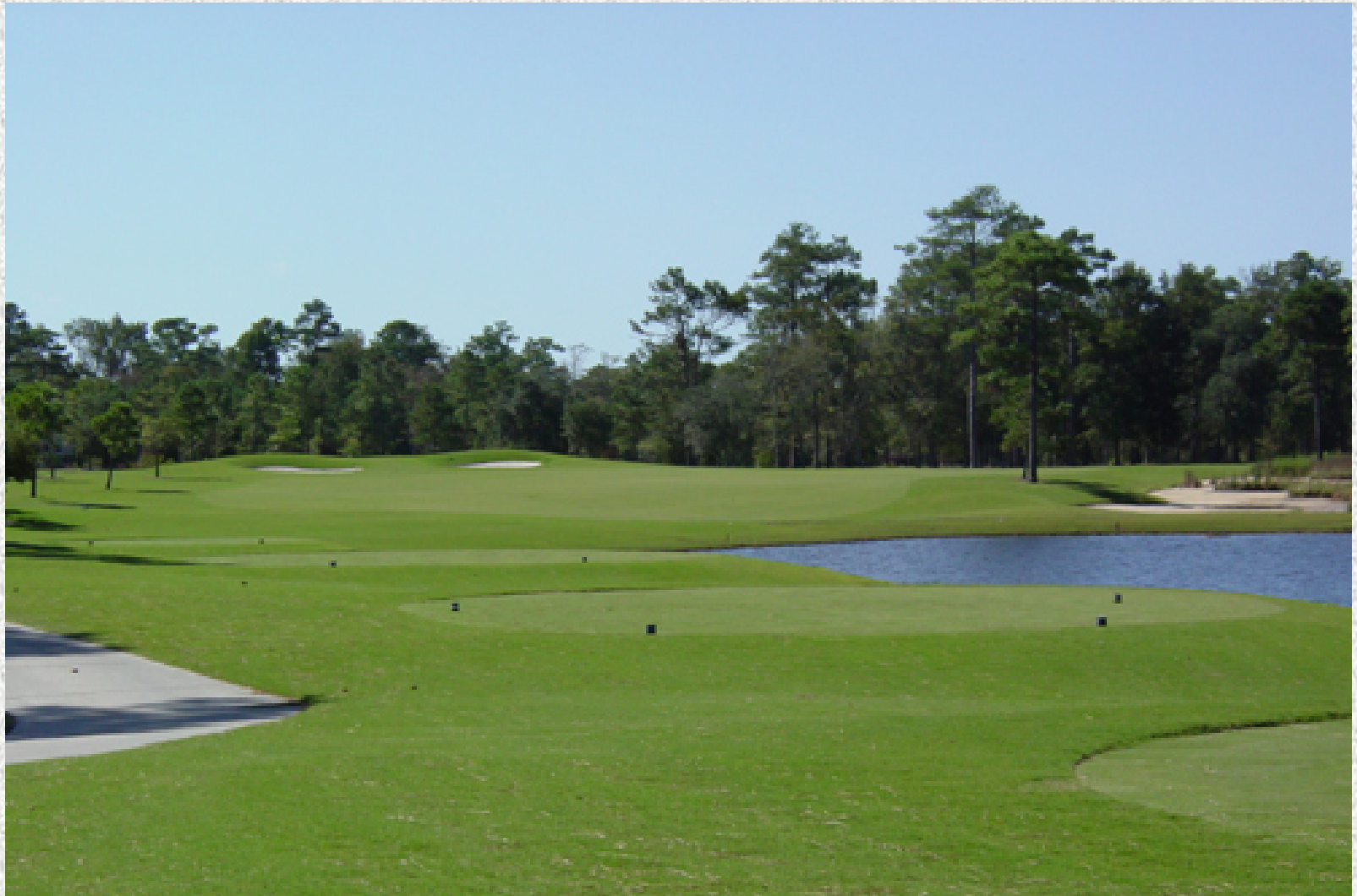
Landfall - Hole 2 - After