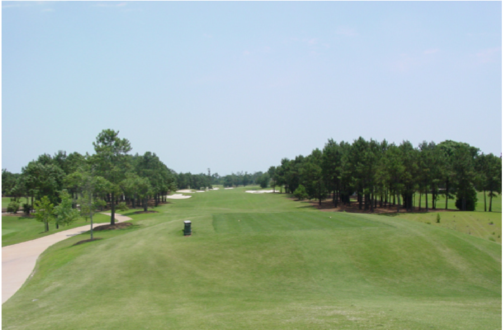
Eagle Point - Hole 18 - Before