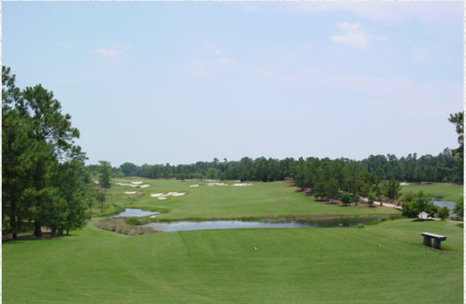
Eagle Point - Hole 17 - Before