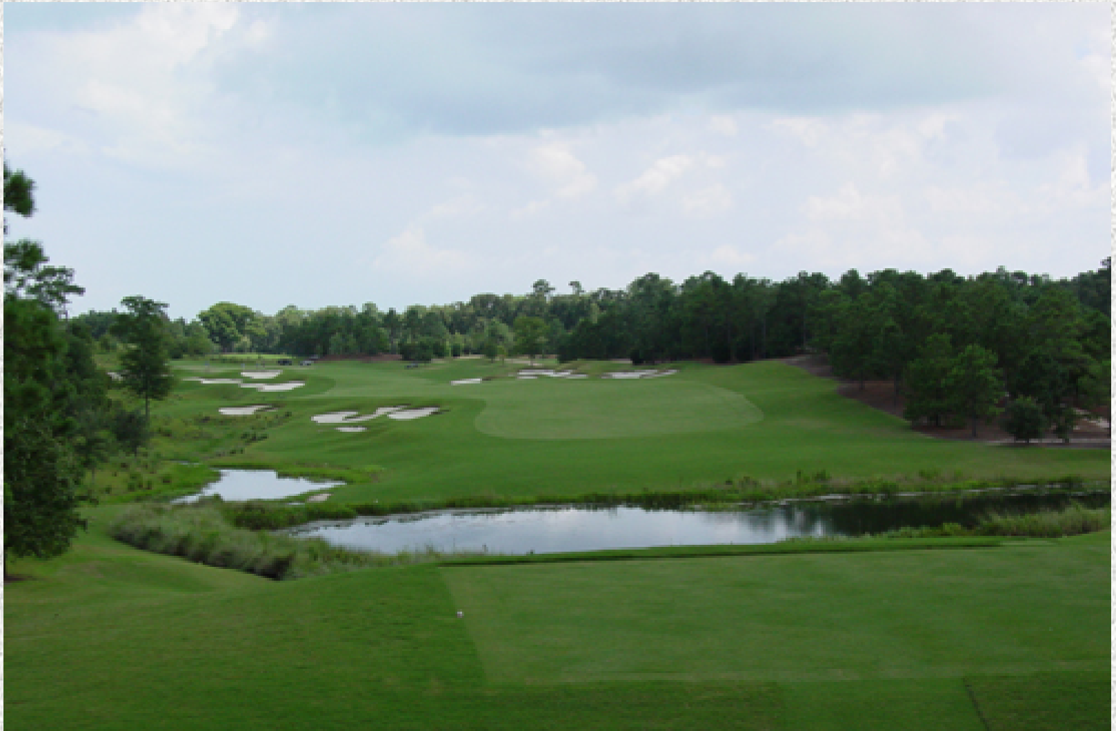
Eagle Point - Hole 17 - After