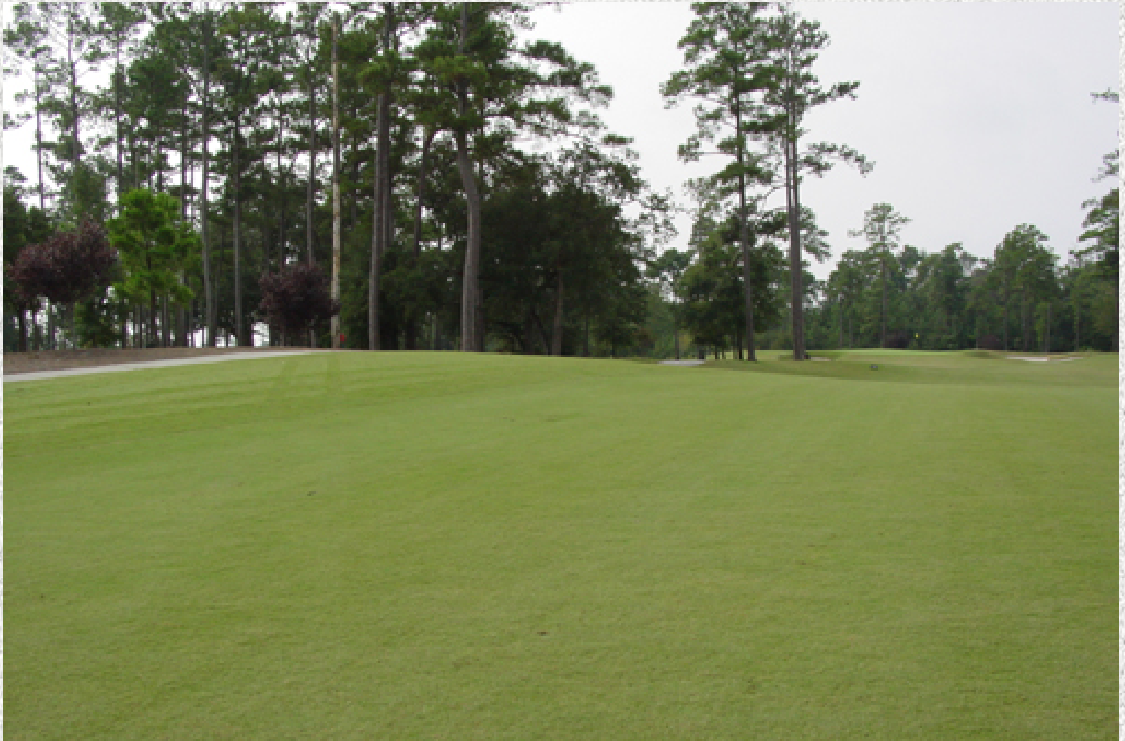
Landfall - Hole 4 - After