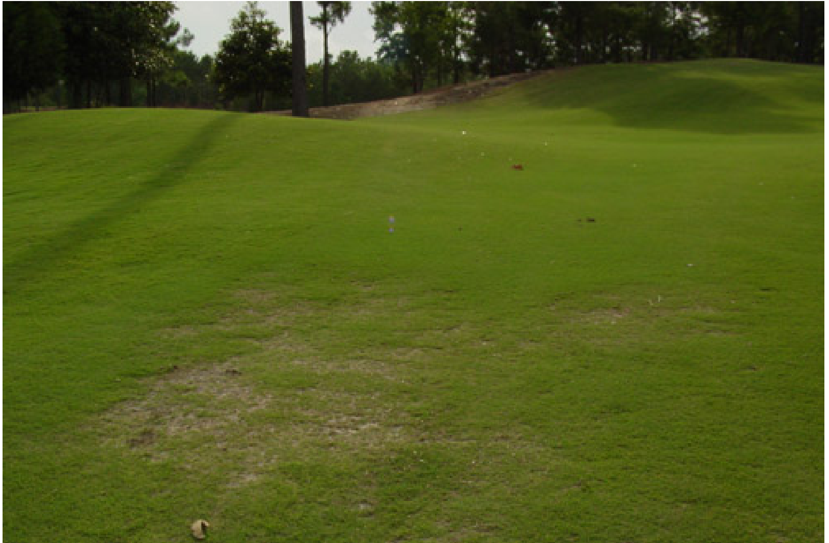
Eagle Point - Hole 3 - Before