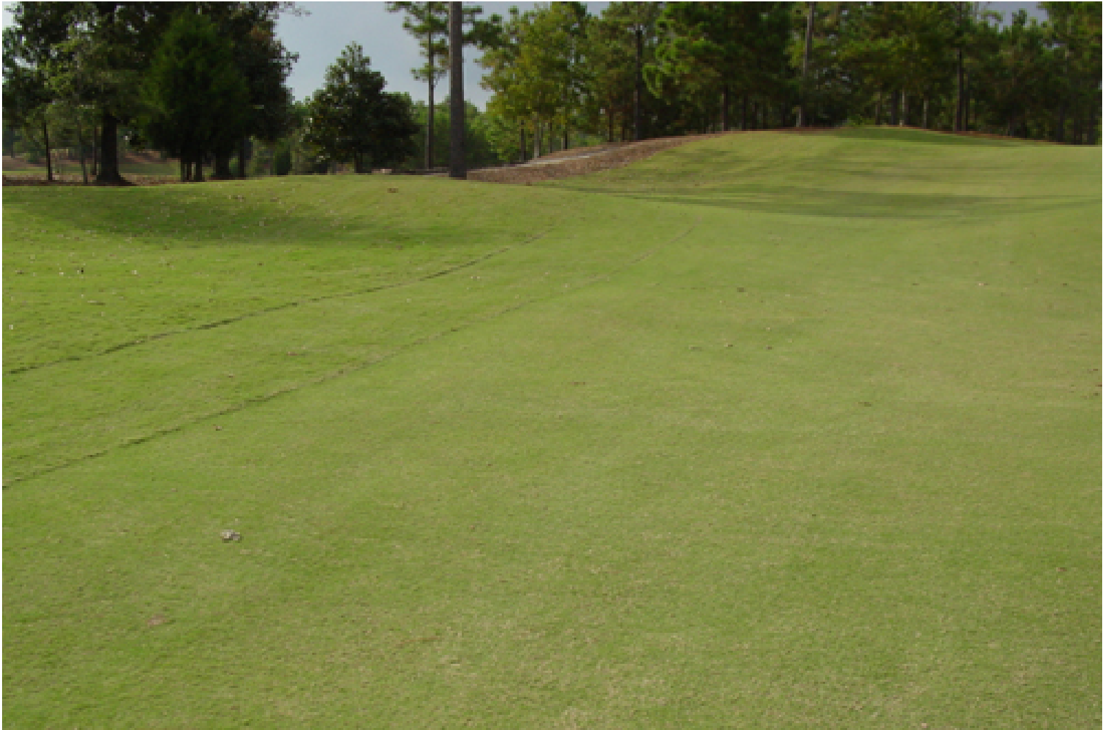
Eagle Point - Hole 3 - After