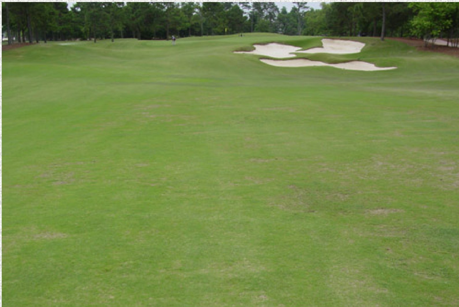
Eagle Point - Hole 8 - Before