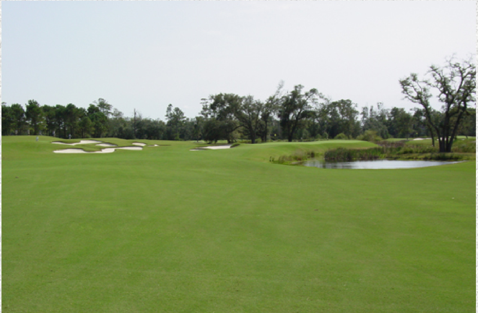
Eagle Point - Hole 18 - After