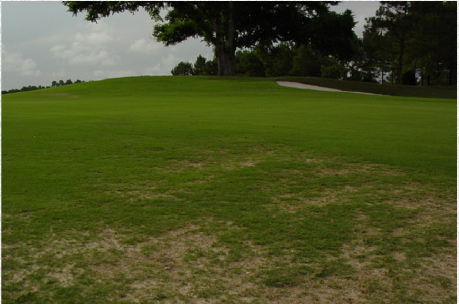
Eagle Point – Hole 11 - Before