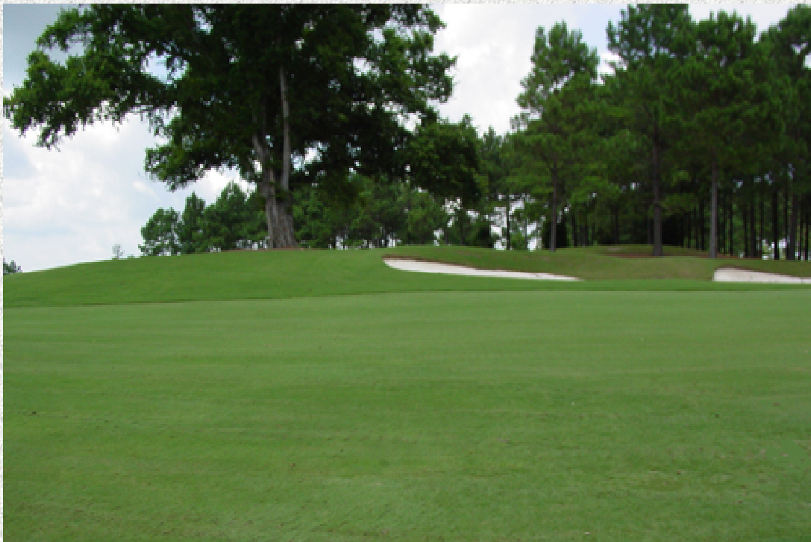
Eagle Point – Hole 11 - After