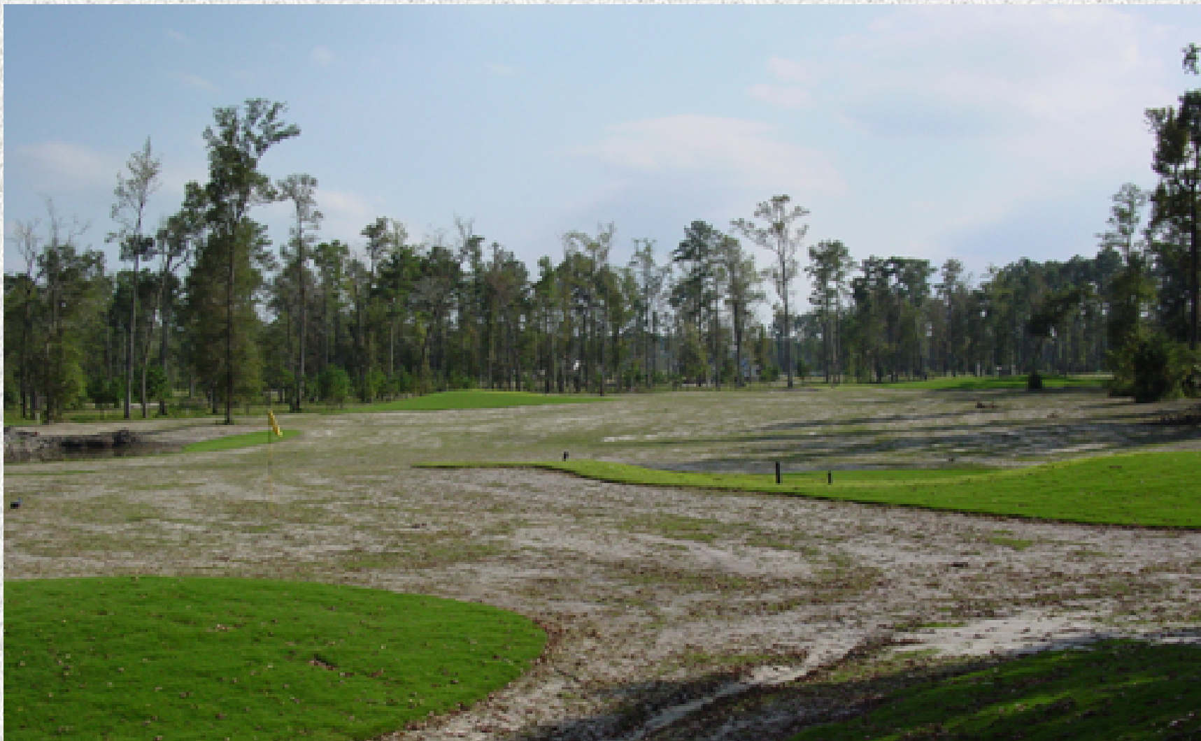
River Landing - Hole 4L - “Grow In” Before