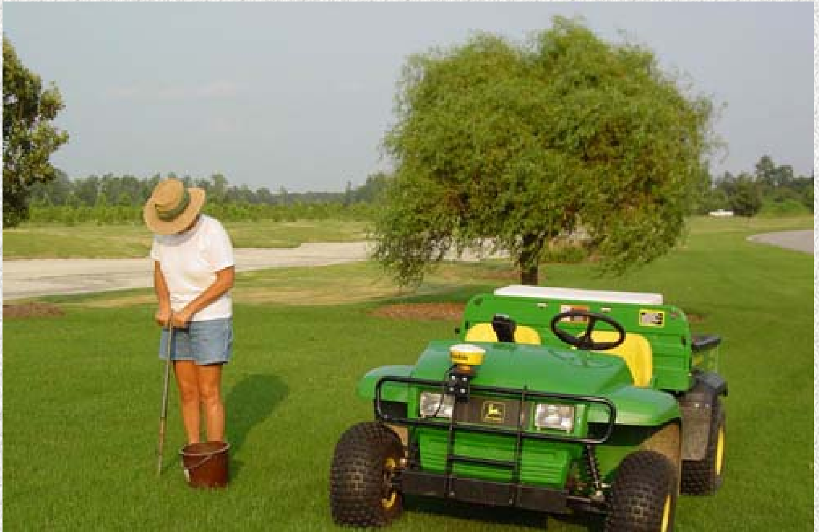
NuTec Soil Sampling