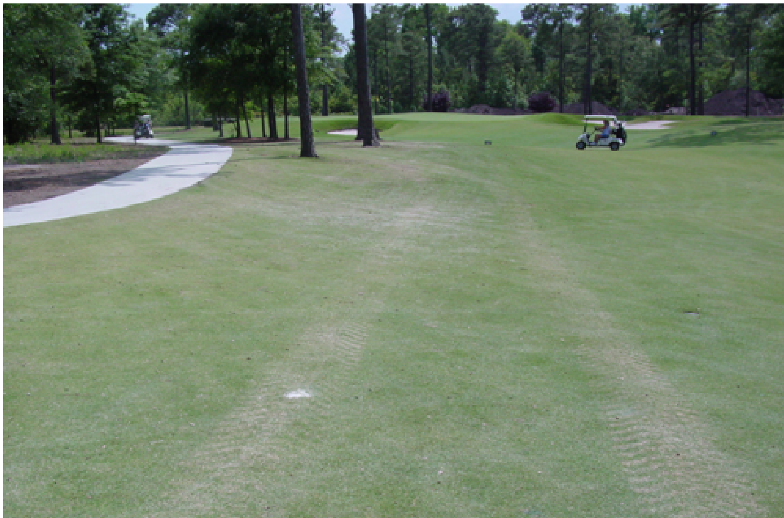
Landfall - Hole 4 - Before