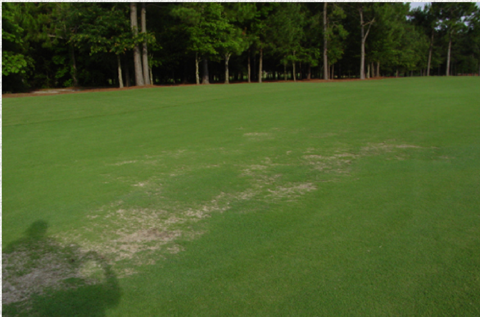
Eagle Point - Hole 8 - Before