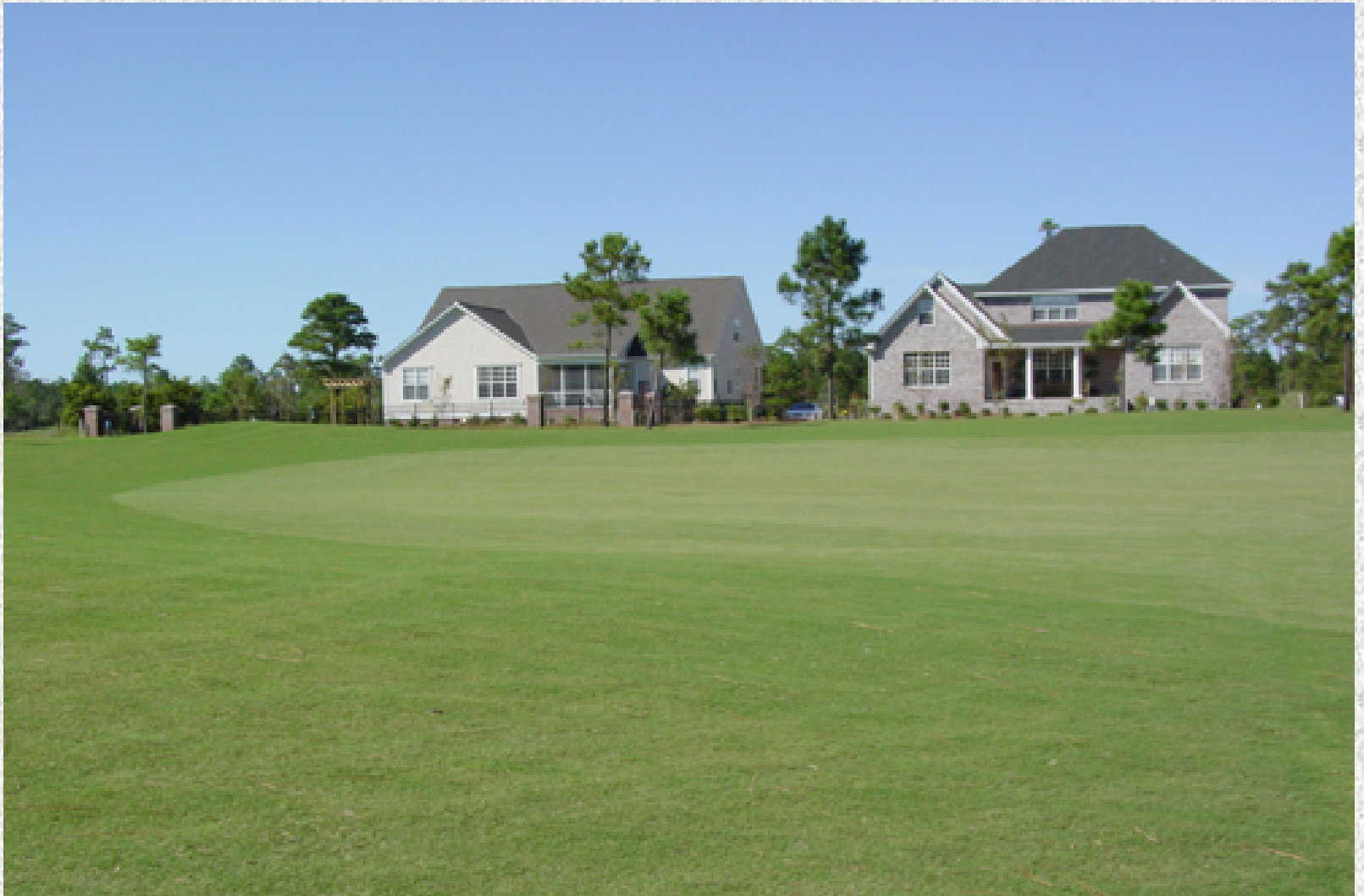
Landfall - Hole 8 - After