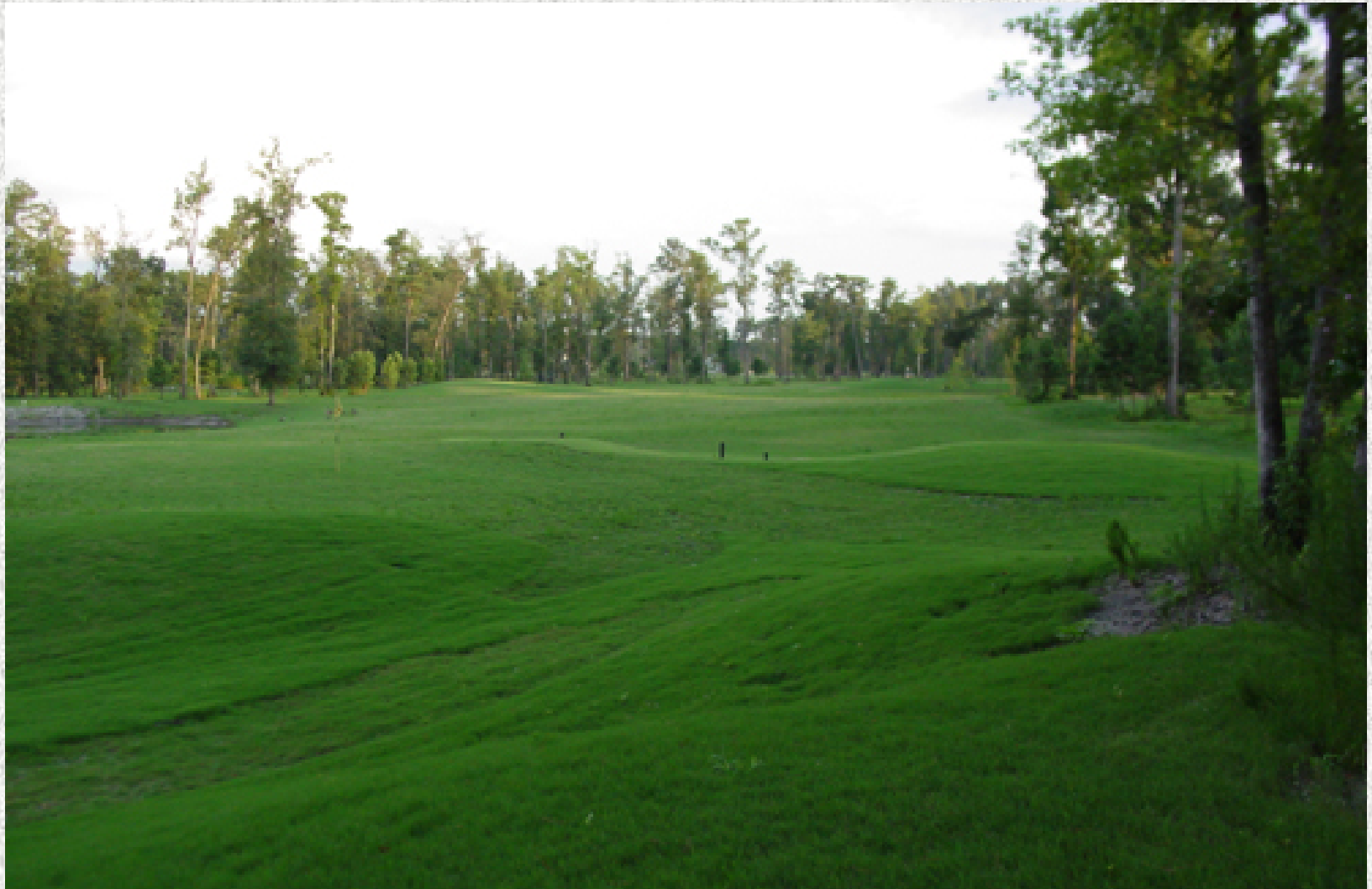
River Landing - Hole 4L - “Grow In” After