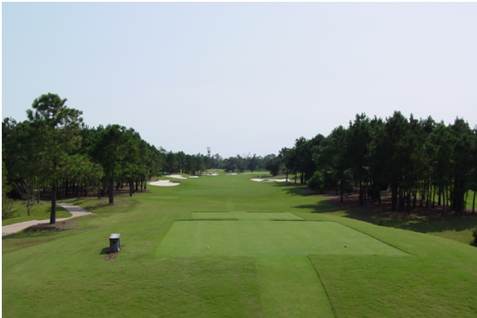
Eagle Point - Hole 18 - After