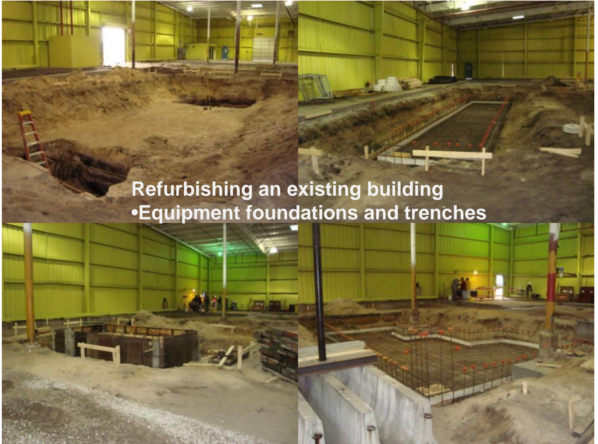
Refurbishing an existing building •Equipment foundations and trenches