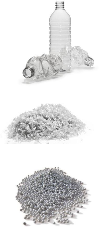
REPREVE Recycling Center; Bottle flake to REPREVE Chip