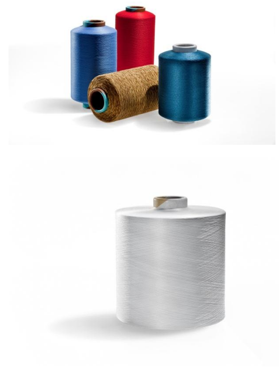
Value-Added Processes – Dyeing, Covering, Twisting, Beaming, Solution and Package Dyed.