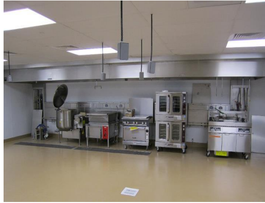
Piedmont Processing Facility

A few of the more prominent development projects that have received ADFP Trust Fund assistance in the first grant cycles include WNC Regional Livestock Facility in Waynesville and the Piedmont Food Processing Center in Hillsborough. These types of facilities have provided improved marketing opportunities and profits for farmers in those regions by adding additional values to the products being sold or establishing a market that allows the farm products a more visible and creditable marketing outlet. These types of activities are essential in maintaining profitability for a producer to stay on the land and be a key contributor to the local community economically. These projects not only enhance the competitiveness of North Carolina agriculture products but also help our citizens with a local supply of healthy produced products. By producing locally our dependence on foreign resources including foreign oil is reduced due the reduction of transportation costs which also helps to decrease our carbon footprint.