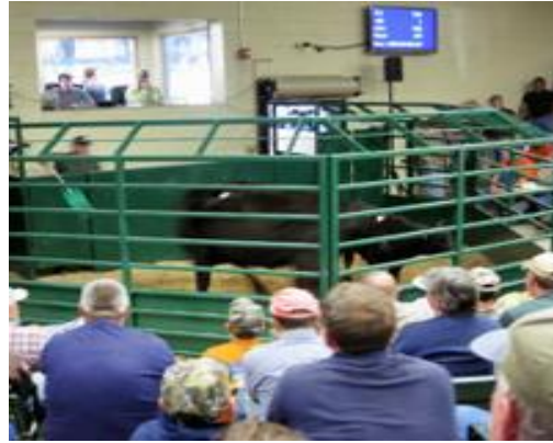
WNC Regional Livestock Facility