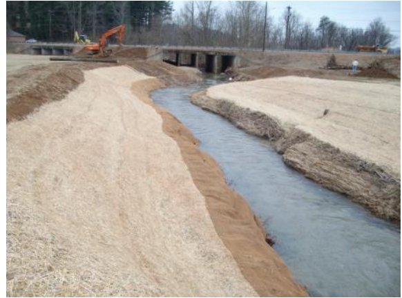
After – stream stabilization project Caldwell County