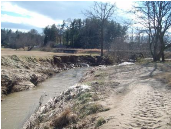
Before – stream stabilization project Caldwell County