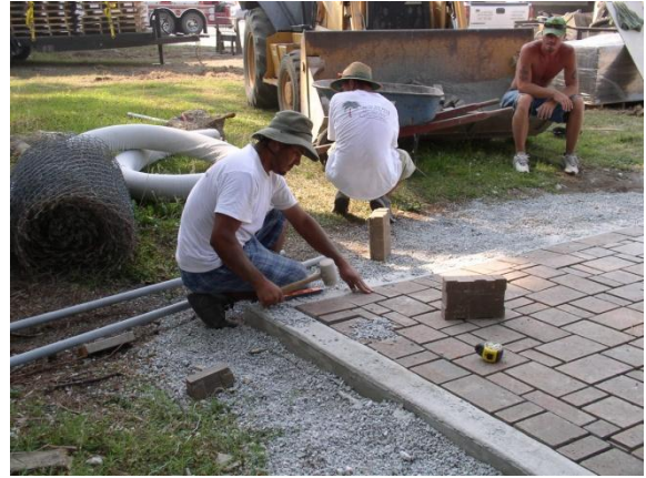
Permeable pavement – Jones County