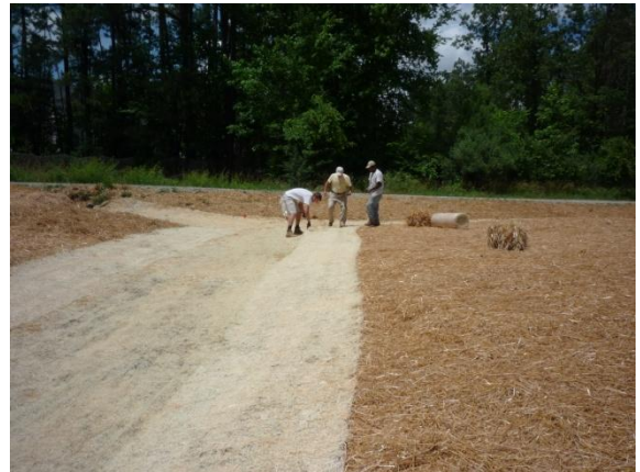
Grassed swale – Wake County