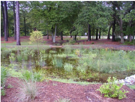
Stormwater wetland – New Hanover County