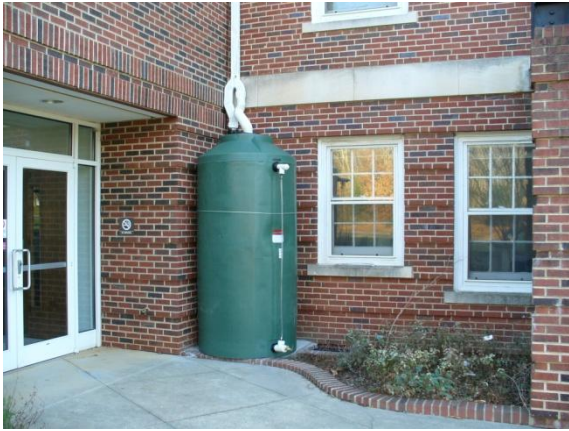
Catawba County – cistern system at municipal building