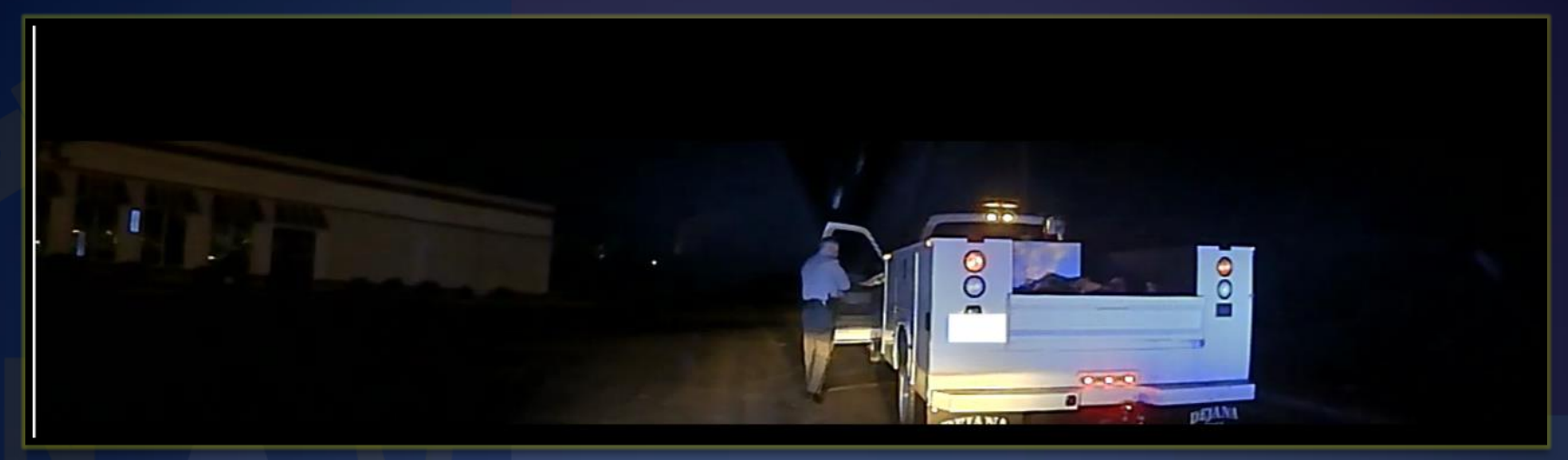
Front-facing panoramic camera