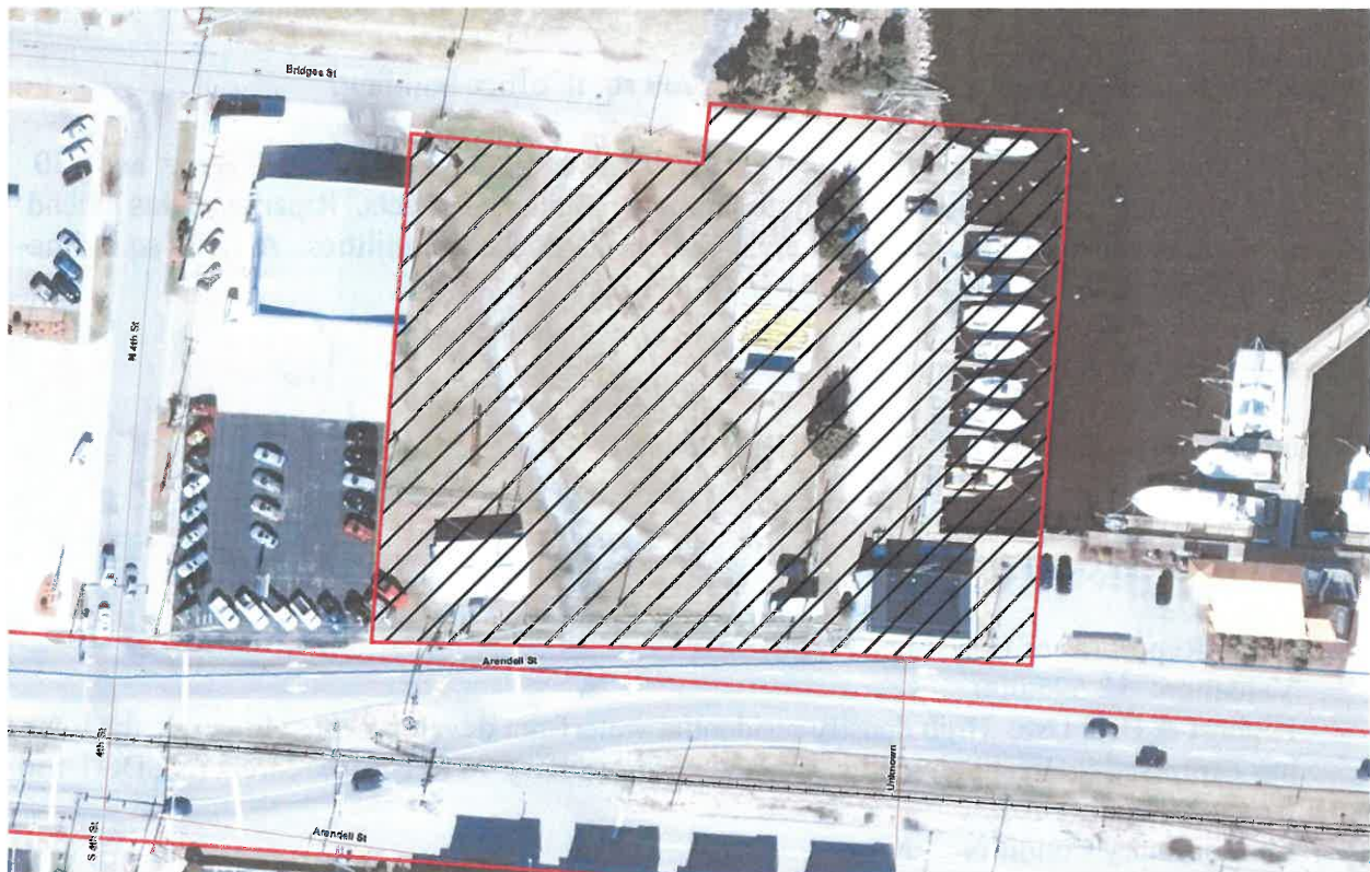
North Carolina Railroad Company Bridges Street Lot Town of Morehead City, Carteret County