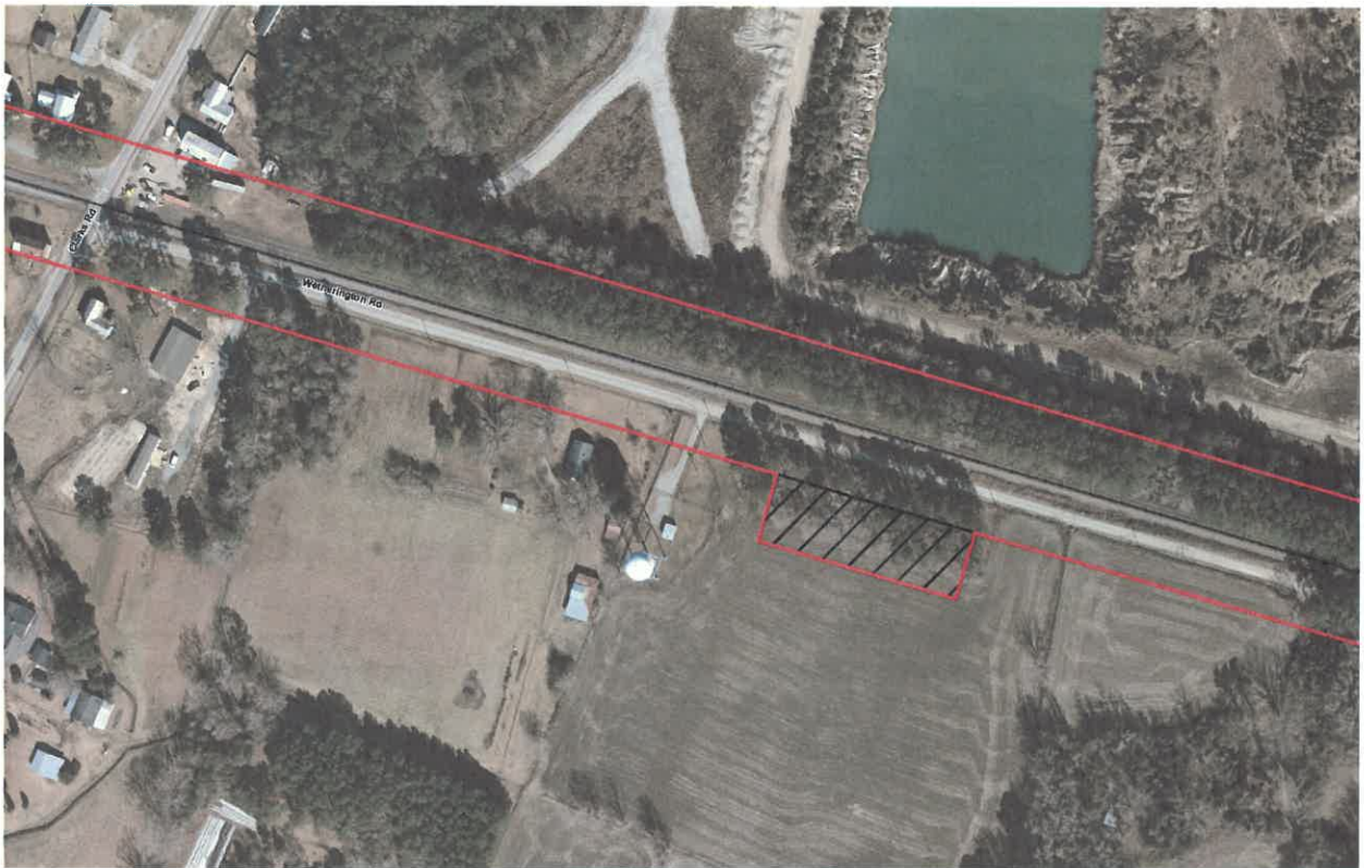
North Carolina Railroad Company Clarks Lot Craven County

Other Issues: Lot is not on a public roadway—land-locked. Adjacent landowner's deed description overlaps with a portion of this parcel.