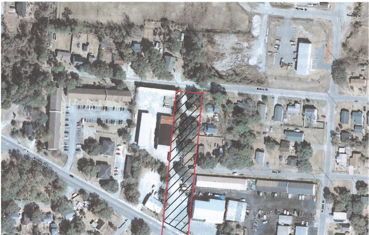
North Carolina Railroad Company Wye Parcel Extension Town of Morehead City, Carteret County

Encroachments: Licensee claims ownership and three adjoining landowners have deeds that overlap with NCRR property line.