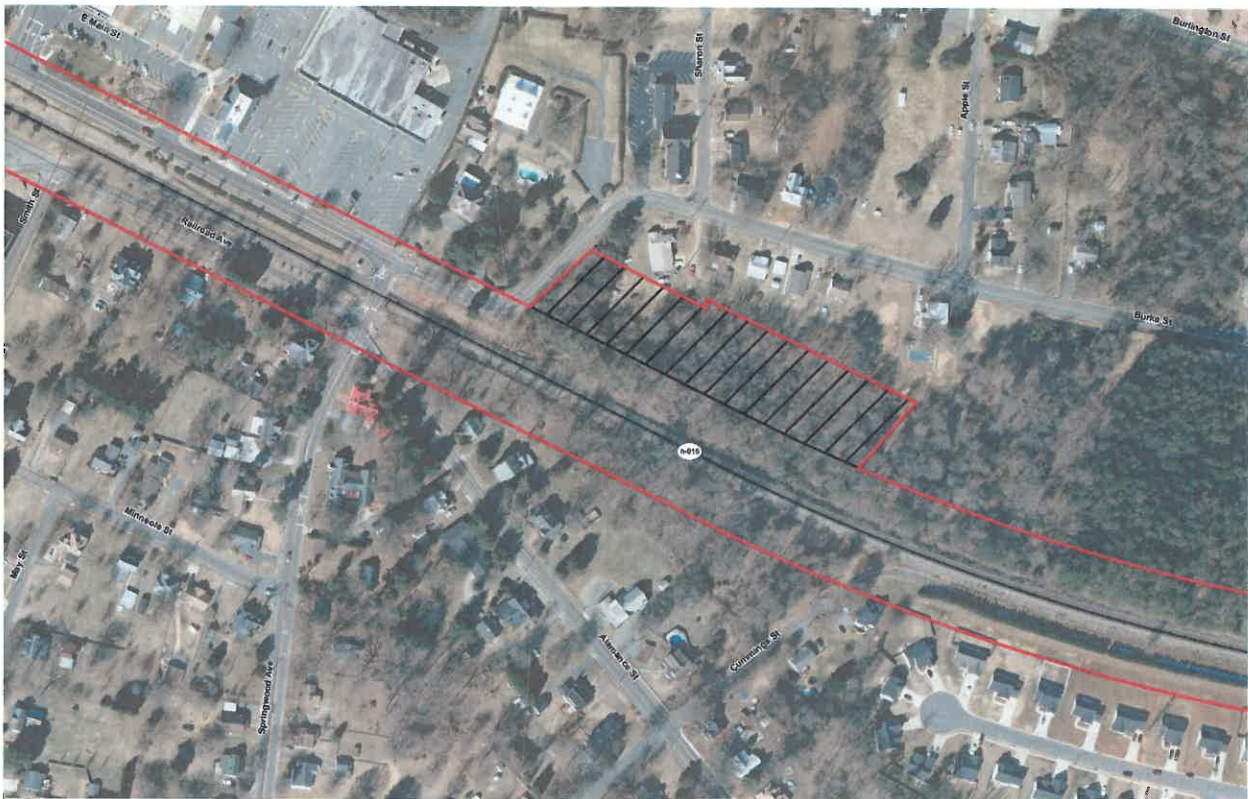
North Carolina Railroad Company Burke Street Lot Town of Gibsonville, Guilford County