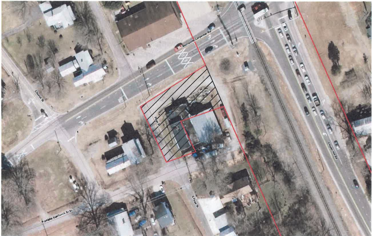
North Carolina Railroad Company Morrisville Lot Town of Morrisville, Wake County

Encroachments: Adjacent building encroachment