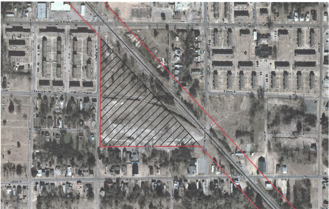
North Carolina Railroad Company Tiffany Street Lot City of Kinston, Lenoir County