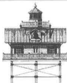
Roanoke River Lighthouse Plymouth, NC