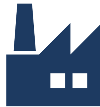
Existing Industry Support