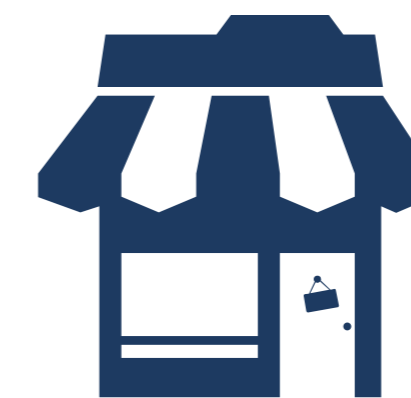
Small Business Support