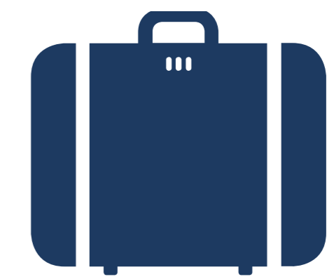
Travel & Tourism