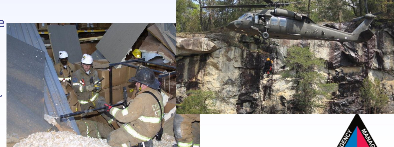
North Carolina Emergency Management