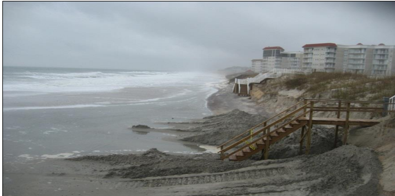
Sand from Inlet Rebuilds NTB Beaches (Pre/Post Photos)