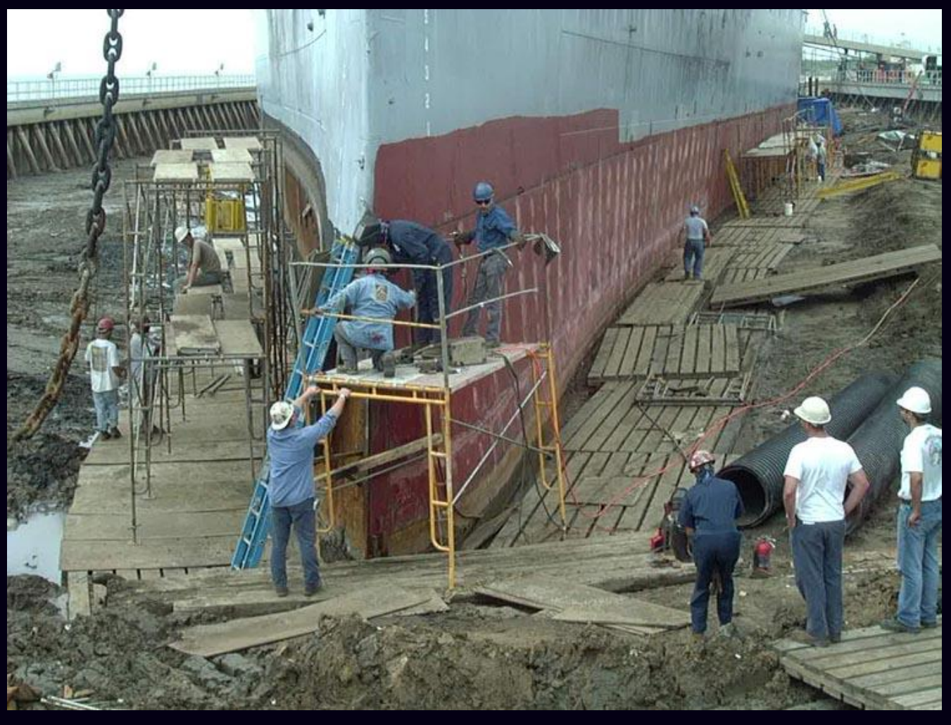
STEEL HULL PLATING REPAIRS