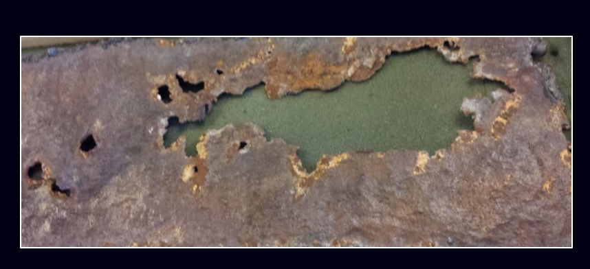
SECTION OF STARBOARD STEEL HULL