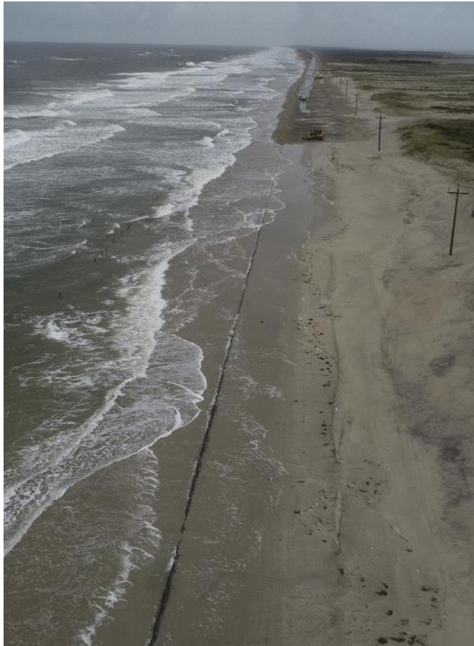
NC. 12 after the hurricane