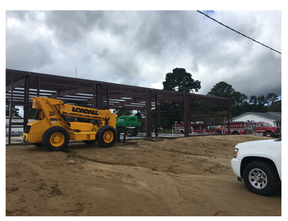
Pine Terrace Fire Department, Lumberton