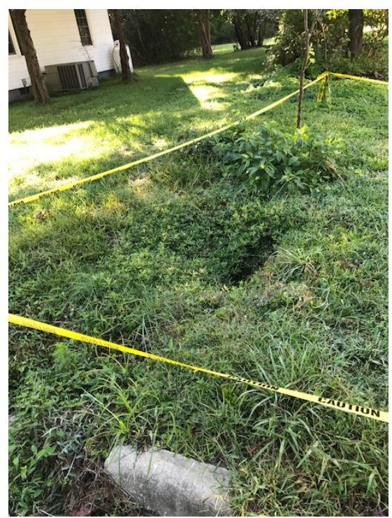
Benson Ayden Fountain