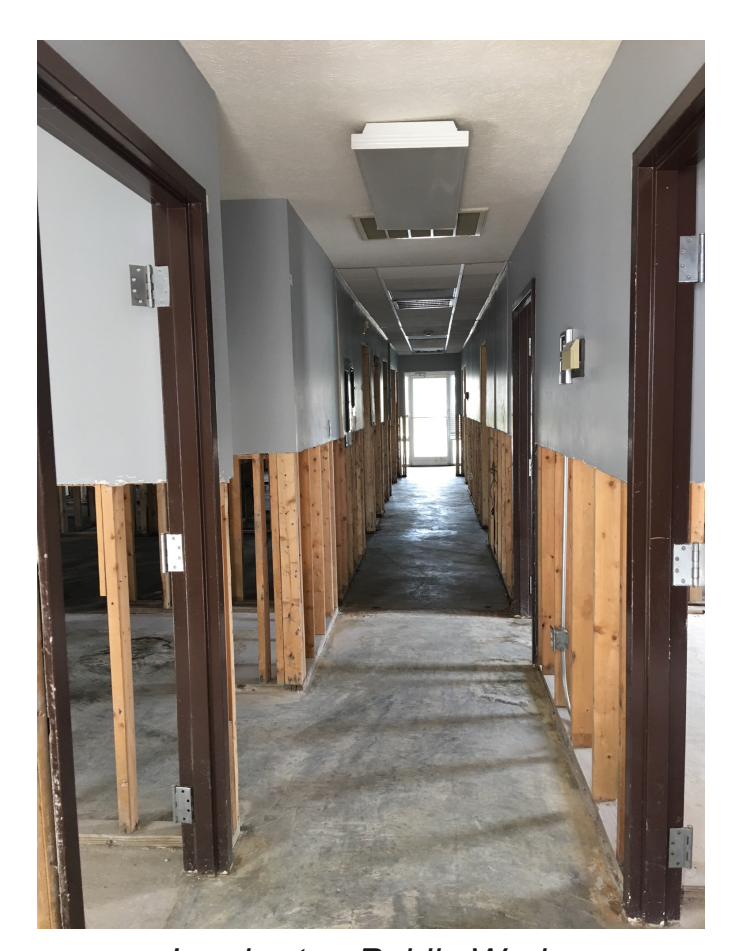
Lumberton Public Works