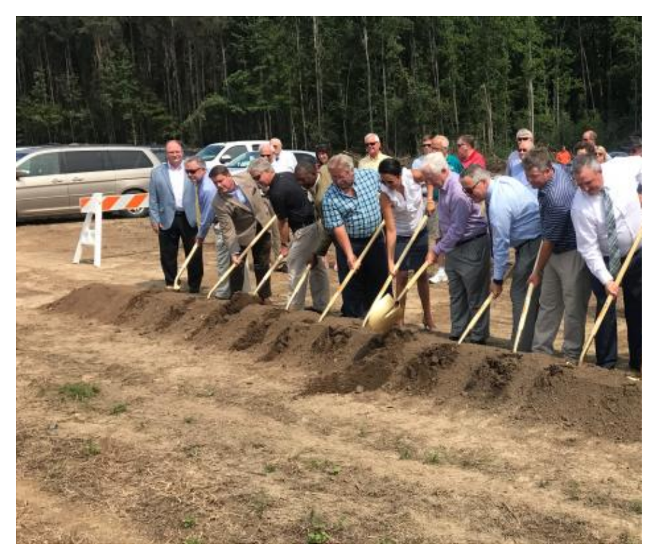
Tabor Landing Groundbreaking, July 25, 2017