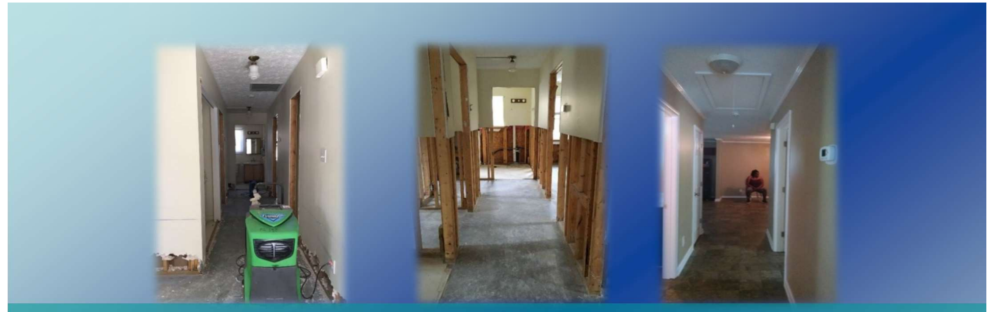
Fayetteville Habitat for Humanity