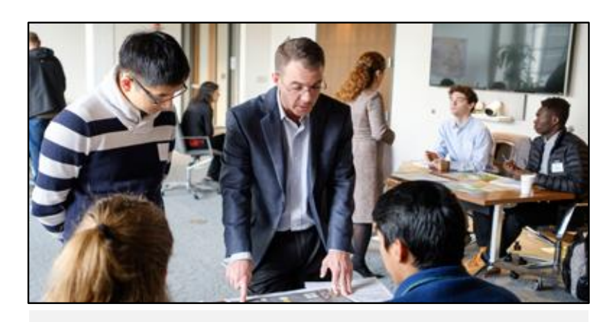
Wake Forest University