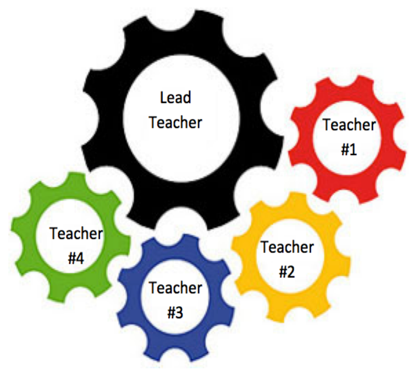
Image 1: The lead teacher facilitates the collaborative teaching community