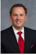
Dan Forest Lieutenant Governor

Room 2104 Legislative Building (919) 733-5190