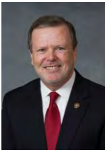
Senator Phil Berger

Room 2007 Legislative Building (919) 733-5708