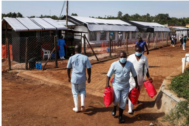
Medical personnel left an Ebola isolation section of the Mubende Regional Referral Hospital in Uganda last month.