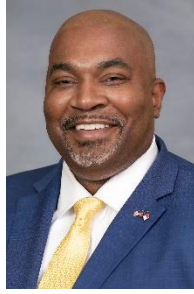
Mark Robinson Lieutenant Governor

Room 2105 Legislative Building (919) 814-3684