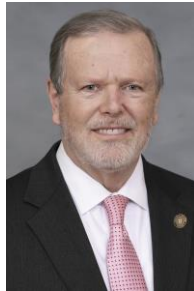
Senator Phil Berger

Room 2007 Legislative Building (919) 733-5708