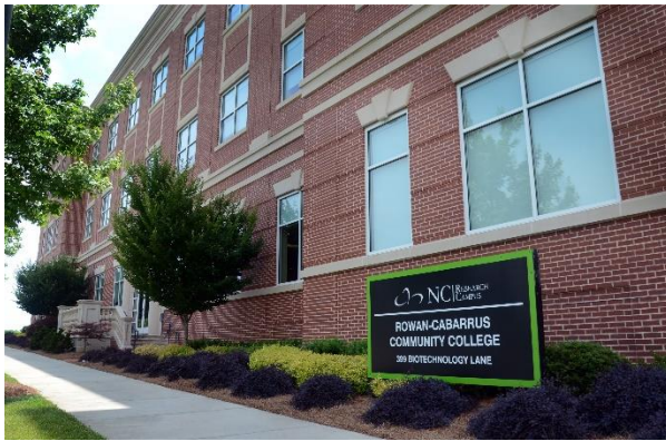
LEFT: Outside photo of the College's location on the North Carolina Research Campus