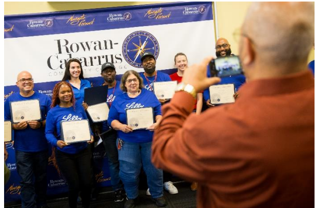
RIGHT: The College's first BioWork program graduates