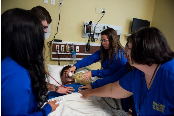
LEFT: Nursing students learning with a high-tech simulator manikin