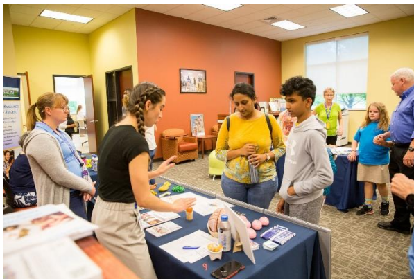
LEFT: Annual STEM Open House that hosts nearly 500 people per year