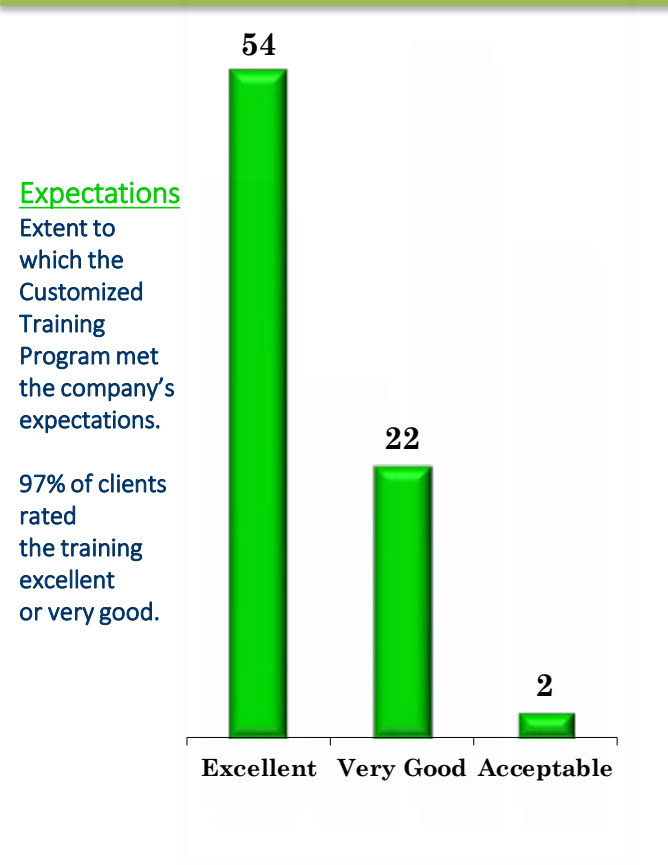
78 completed evaluations by client companies in the Expectations category.

Rating Scale: 5 = Excellent (highest) - 1 = Unacceptable (lowest)