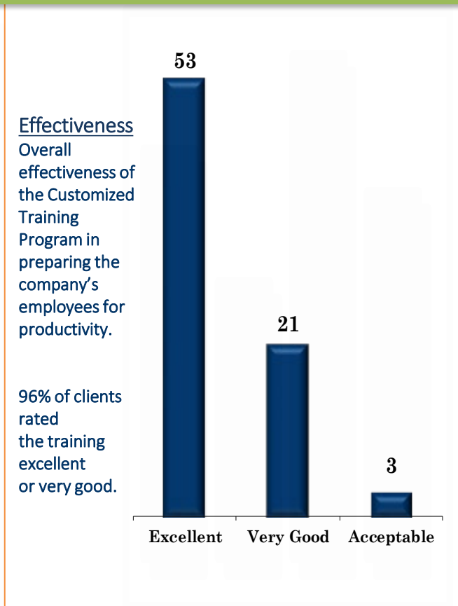
77 completed evaluations by client companies in the Effectiveness category.