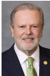
Senator Phil Berger

Room 2007 Legislative Building (919) 733-5708