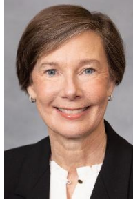
Rachel Hunt Lieutenant Governor

310 N. Blount Street Room 1115 Legislative Building (919) 814-3680